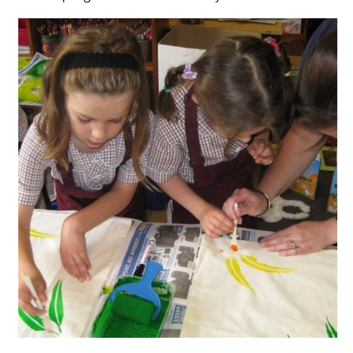
Total incursion and excursion student numbers by term:

The centre provides professional learning for teachers and learning activities for students in many different formats, including incursions, excursions, units of work, video conferences, theme programs and mandatory fieldwork.